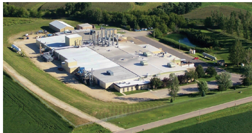
Norplex-Micarta global headquarters in Postville, Iowa, USA

Norplex-Micarta is the leading manufacturer of high performance thermoset composites. Norplex-Micarta's vast product line of tubing, sheet, pre-preg, and rod products serves power generation, military/aerospace, oil & gas, medical device, electrical device, electronics assembly, construction, heavy industry, and transportation industries throughout Asia/Pacific, Europe, and the Americas.