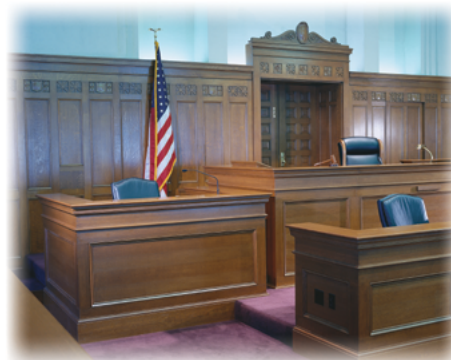
Superior protection for courtrooms, check-cashing, and convenience stores

ShotBlocker meets the requirements for courtroom, check-cashing, gas station, and convenience market armor, providing superior security and protection in walls, doors, and counters. The material can also be used for military/defense architectural applications in the field, such as guard stations. Overall, ShotBlocker performs similarly to that of conventional S-glass laminates, which cost considerably more.