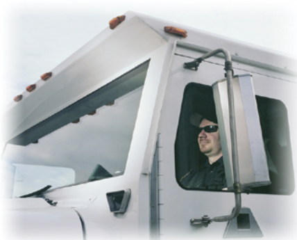
Alternative to steel for armoring trucks, jeeps, and aircraft

Excessive weight is also a problem in airborne applications. The use of steel armor would result in significant reductions in aircraft performance, range, and payload.